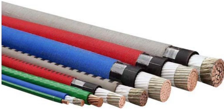
ABB Critical Power KS-24194 Power Wire is a rugged, RHH wire rated for 600 V and is available in several colors.

The economical KS-24194 non-halogenated copper wire is flame-retardant, low smokeemitting, and recommended for use in 600 V RHH* telecommunication power plant applications.